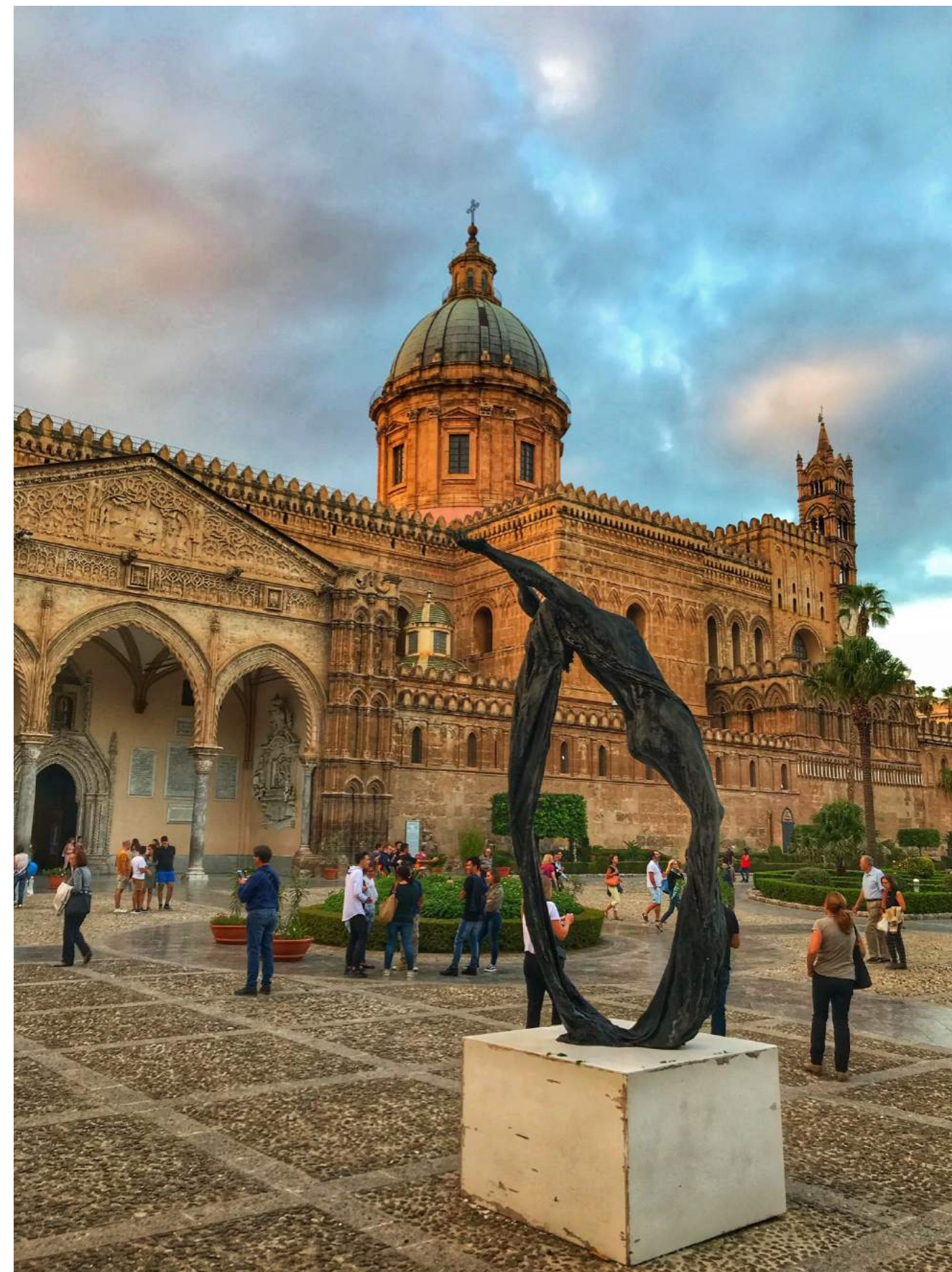
Palazzo Imperatore (view form the palace)