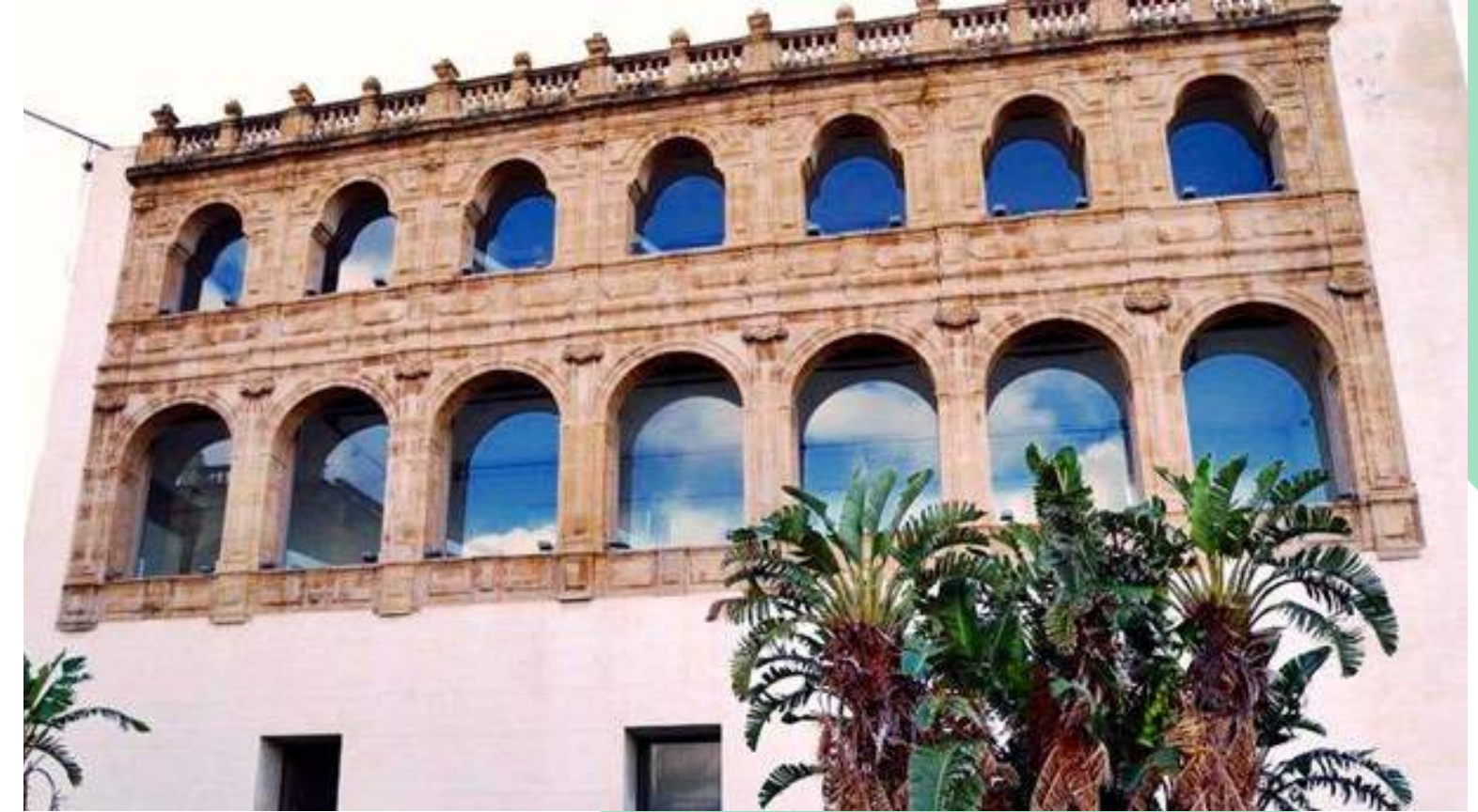
Terrazza del Loggiato San Bartolomeo