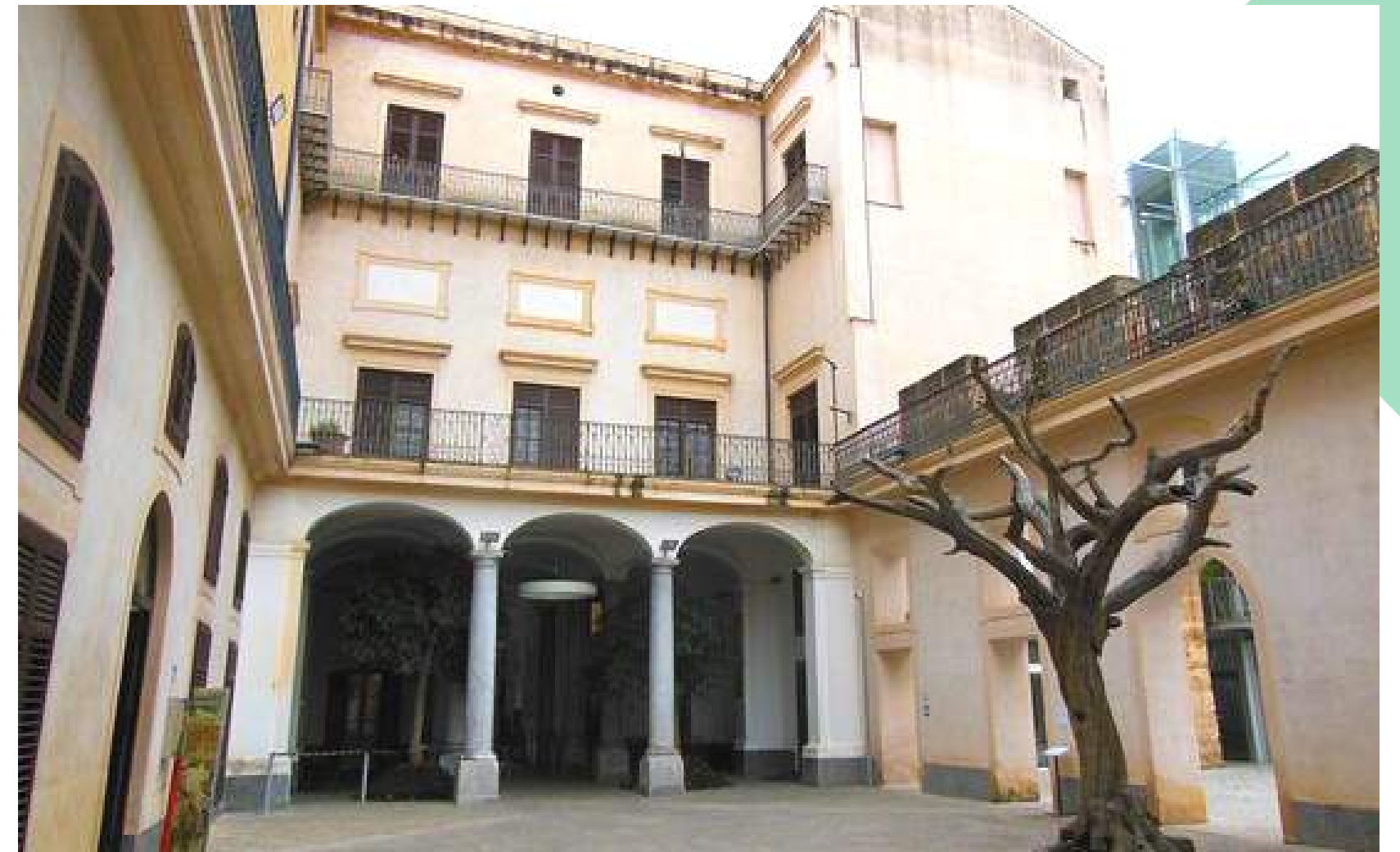
RISO - Museo d'arte contemporanea della Sicilia