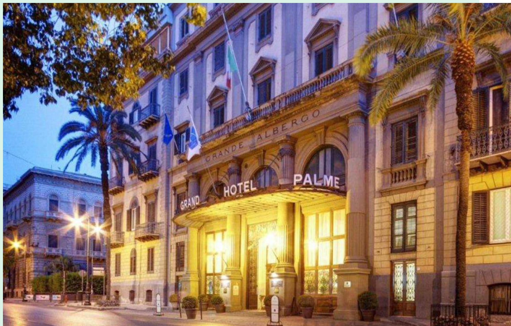
Hotel delle Palme