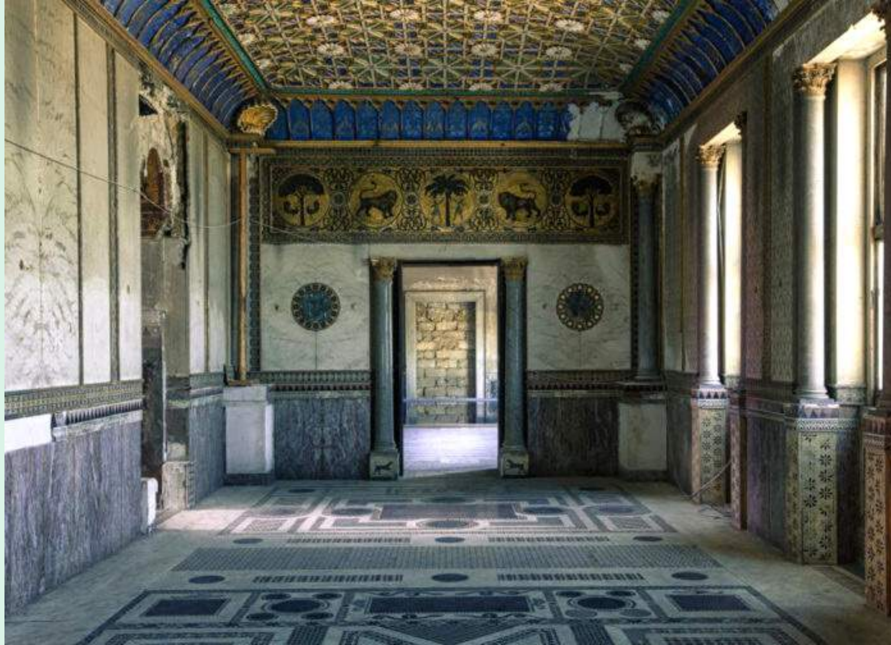
Palazzo Forcella De Seta