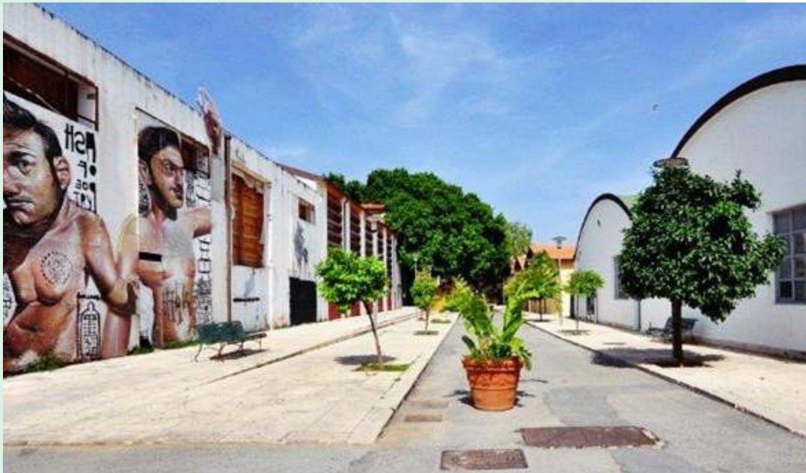
Cantieri Culturali della Zisa