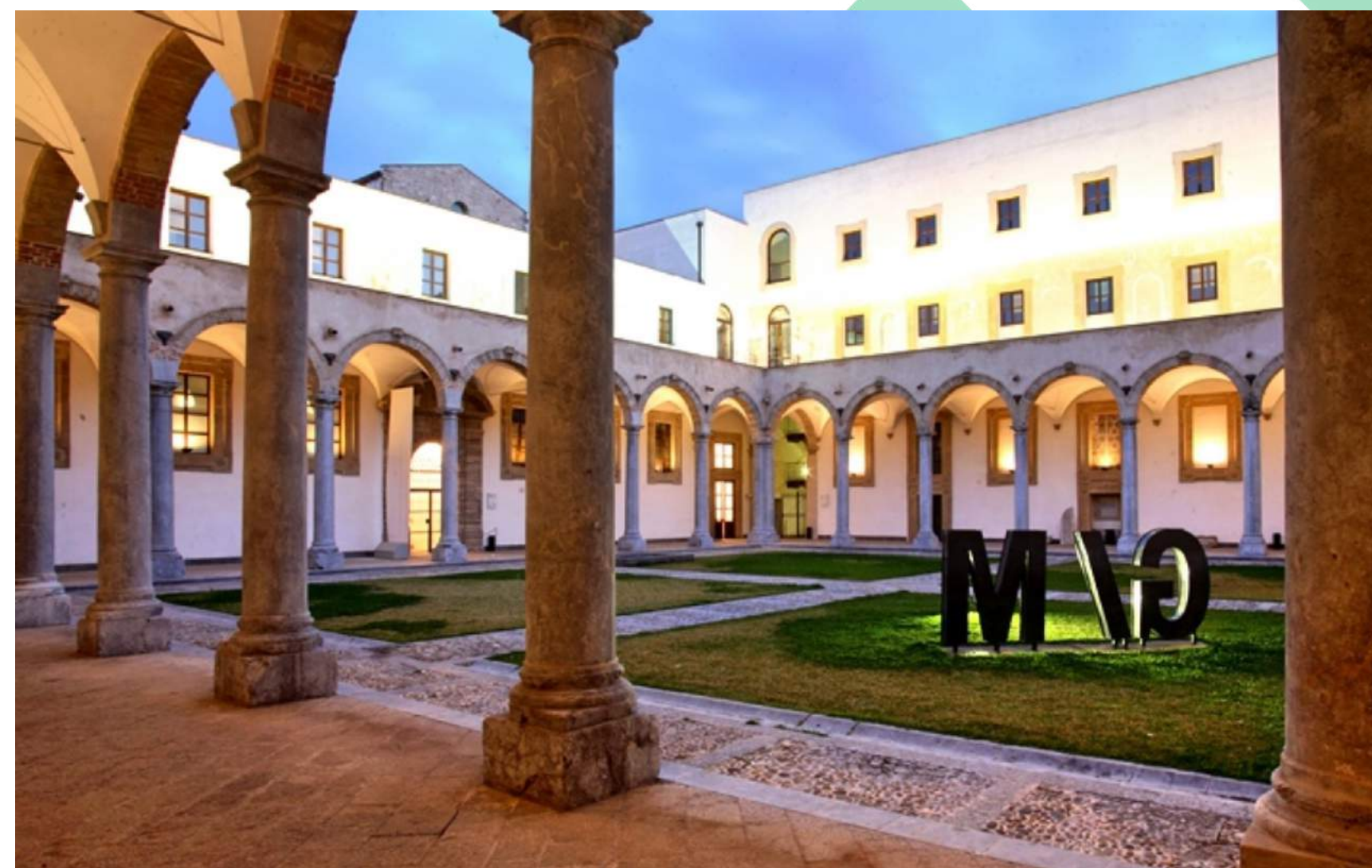
GAM - Galleria di Arte Moderna