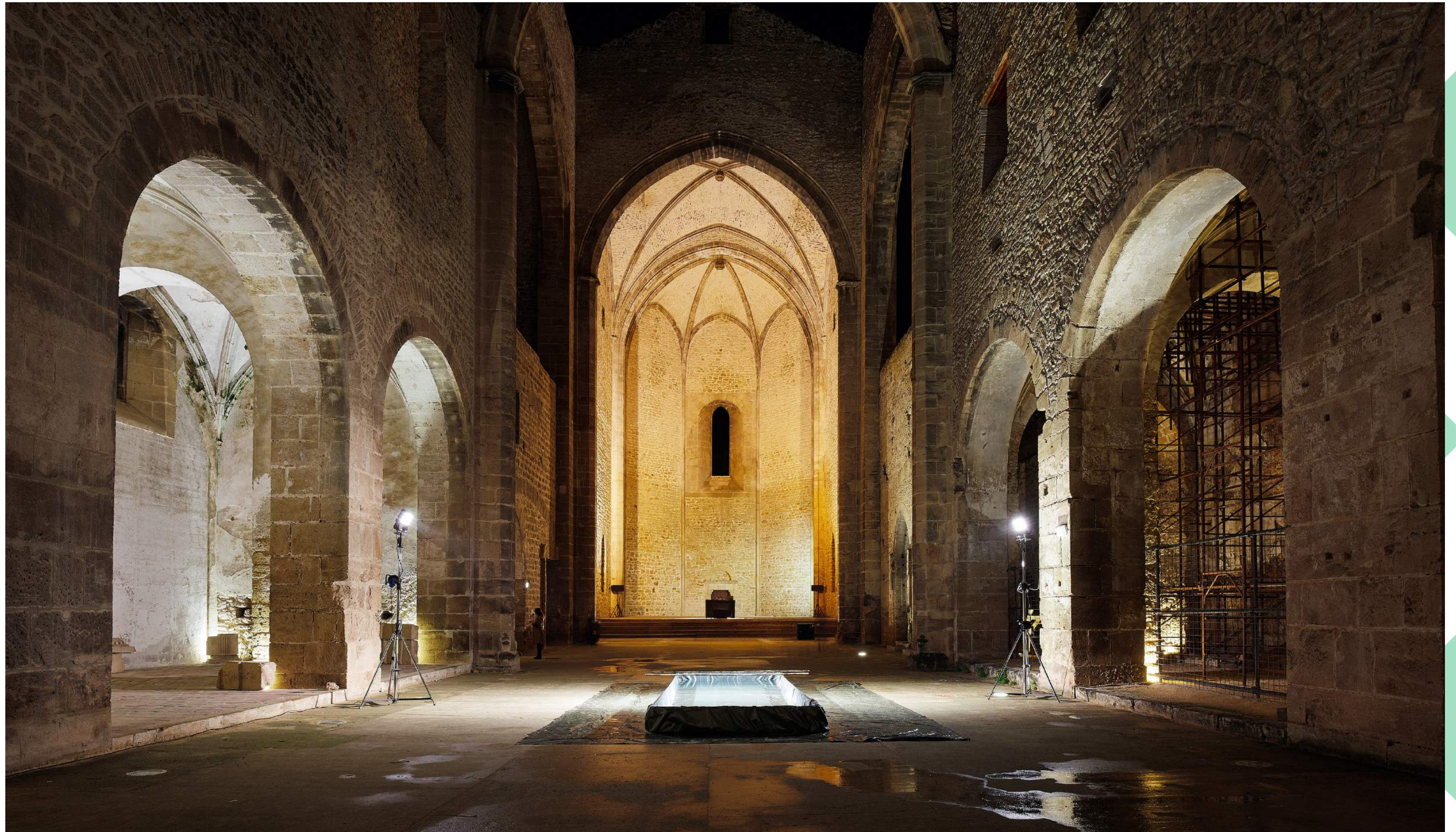
Santa Maria dello Spasimo